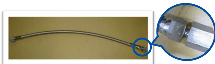
Flexible tube Classification marking on the socket end