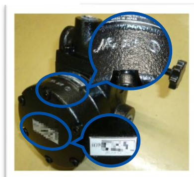
Fuel oil pump Classification marking and name plate

Scan the QR code or click on the following URL for information about our service network.